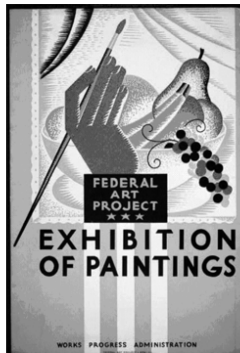
"Exhibition of Paintings." Ill. : Federal Art Project, WPA, [between 1936 and 1941], in By the People, For the People : Poster From the WPA, 1936-1943. Digital ID: http://hdl.loc.gov/loc.pnp/cph.3b49490

An outstanding example of government posters are those published by the U.S. Works Projects Administration (WPA) by the Library of Congress in its digital online library, American Memory Over 900 posters are digitally reproduced from the American depression-era,