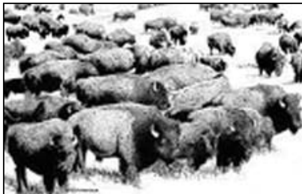
Buffalo herd, created for the U.S. Fish and Wildlife Service by Bob Savannah http://www.fws.gov/pictures/lineart/bobsavannah/buffaloheard.html . Accessed March 13, 2006.

Prints and Photographs Division Reading Room, by the Library of Congress ( http://www.loc.gov/rr/print/ ) This website provides catalogs and indexes to print and digital images, some published in American Memory collections. The Prints & Photographs Online Catalog describes about 65% of the Divisions holdings, includes many digital images. Another resource by subject is the Division's Lists of Images on Popular Topics. Not all images are in the public domain. One of the most heavily used online collections is the Historic American Buildings Survey (HABS) and the Historic American Engineering Record (HAER) collections. ( http://memory.loc.gov/ammem/collections/habs_haer/ ) This collection includes images of comprehensive range of building types [Figure 3] and engineering technologies digitized from measured drawings, black-and-white photographs, color transparencies, photo captions, and also data pages. Prints and Photographs Division Reading Room also links to a digital collection of caricature and cartoons.