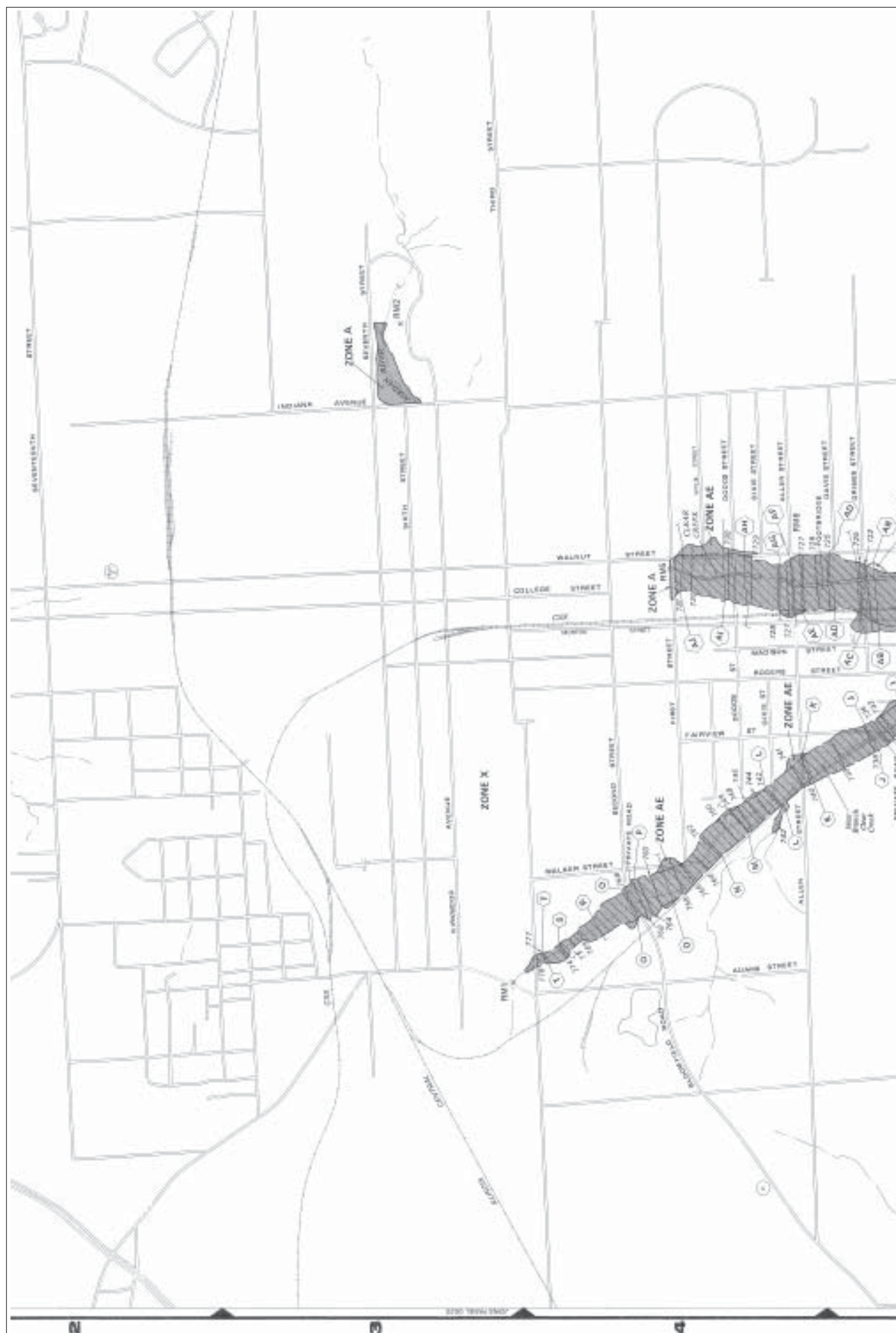
FIGURE 4. Portion of the Flood Insurance Rate Map showing an area of the Indiana University Campus.